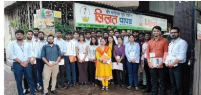
Visit to Lijjat Papad