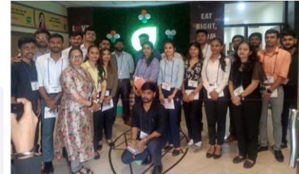
Visit to Kissan Connect