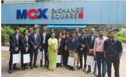
Visit to MultiCommodity Exchange