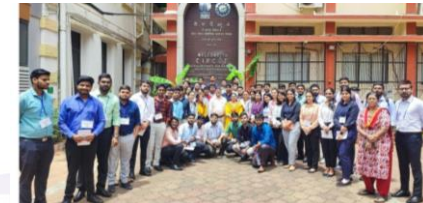
Visit to CIRCOT