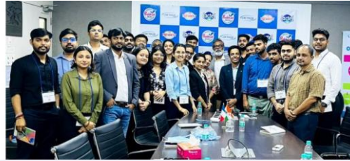
Visit to Prabhat Dairy