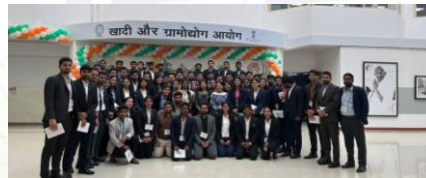
Visit to KVIC- Khadi and Village Industries Commission