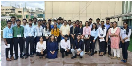
Visit to Olive Oil at Deoleo