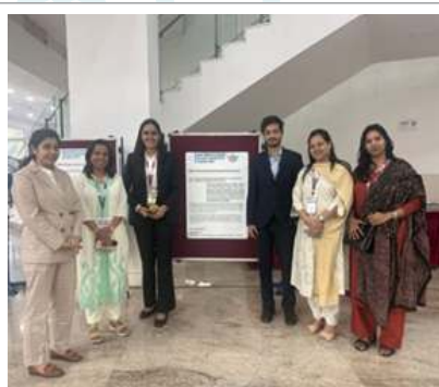
1st Position in GWHIC Poster Competition 2024