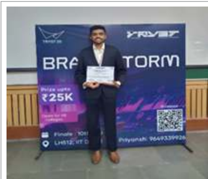
2nd position in Brandstorm at IIT D