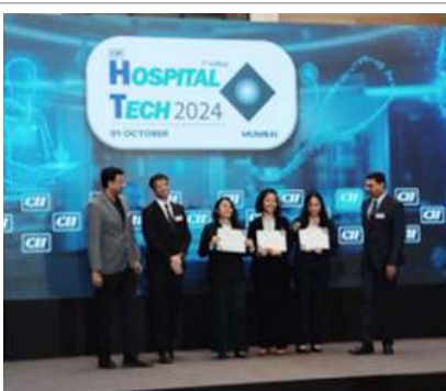
1st Position in CII Poster Competition

Students are given opportunities to participate in various extra-curricular activities creating well-rounded professionals.