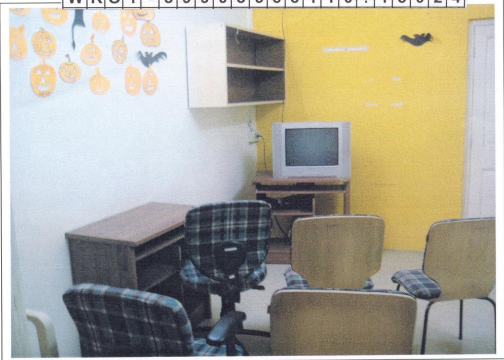
3) Other Facilities at Hostel (T.V. Room)