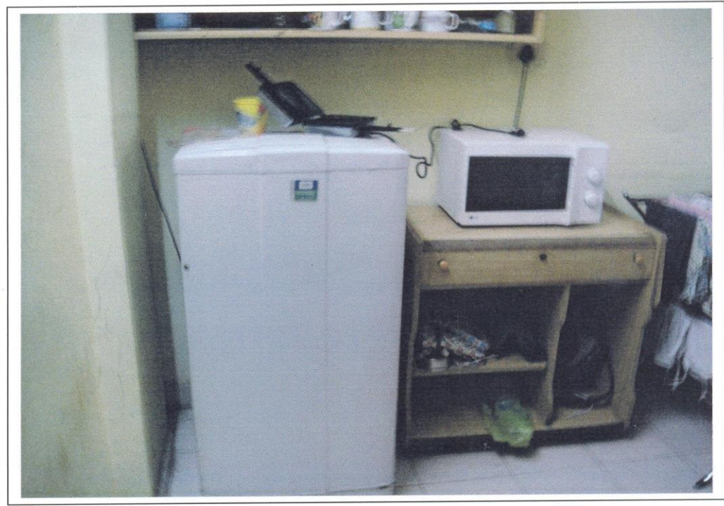
4) Other Facilities at Hostel (Refrigerator & Microwave Oven)