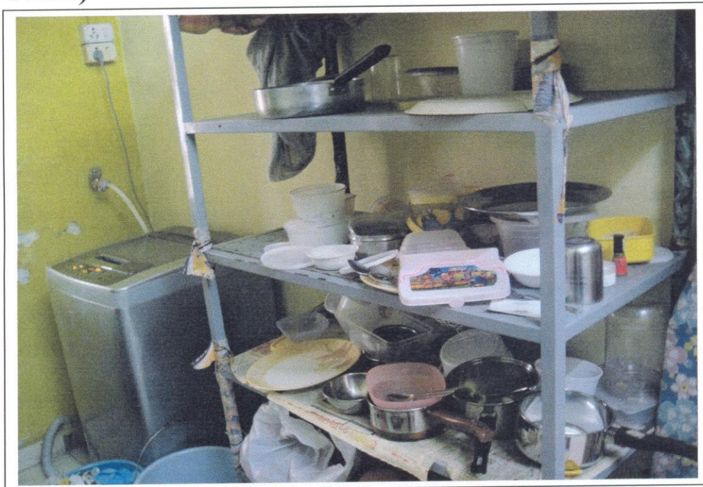
6) Other Facilities at Hostel (Washing Machine & Pantry)